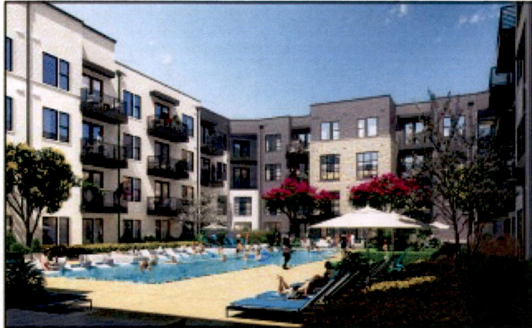
Multi-family Residential Structure with Attached Parking