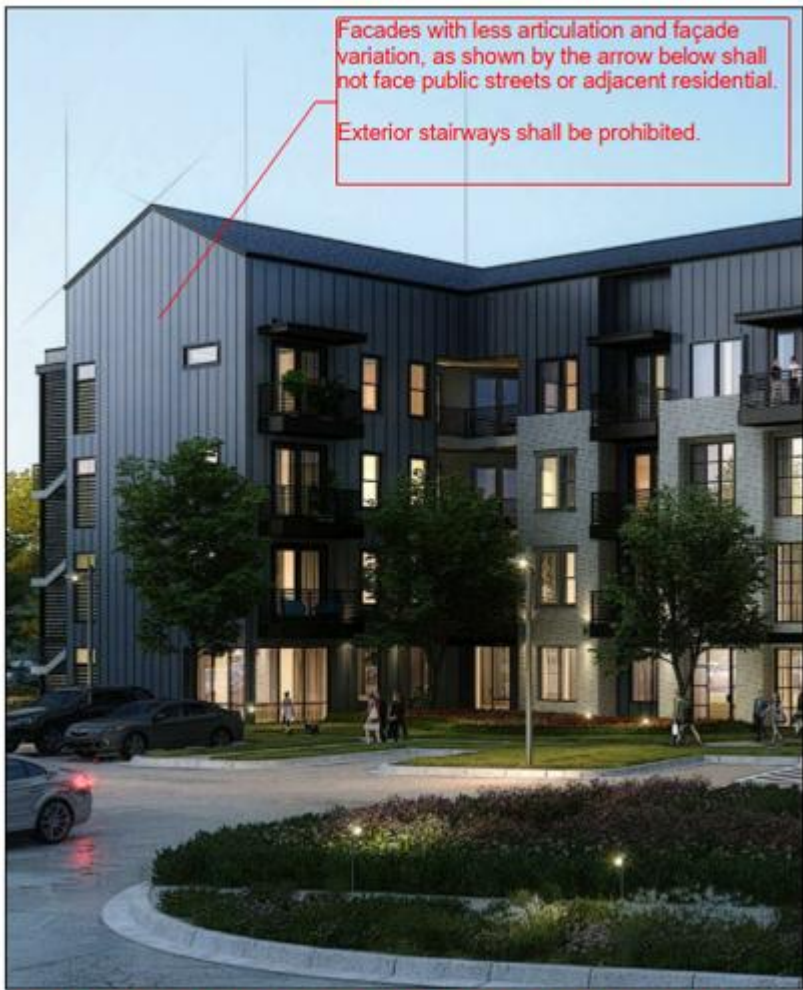
Multi-family Residential Structure with Surface and "Tuck Under" Parking