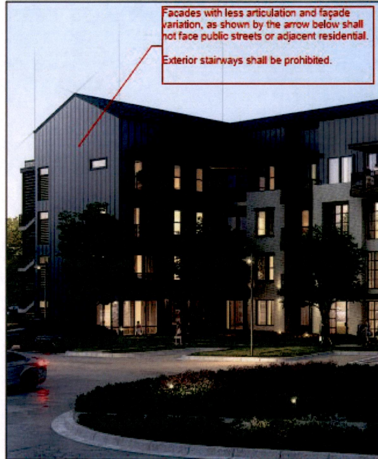
Multi-family Residential Structure with Surface and "Tuck Under" Parking

Facades with less articulation and façade variation, as shown by the arrow below shall not face public streets or adjacent residential. Exterior stairways shall be prohibited.