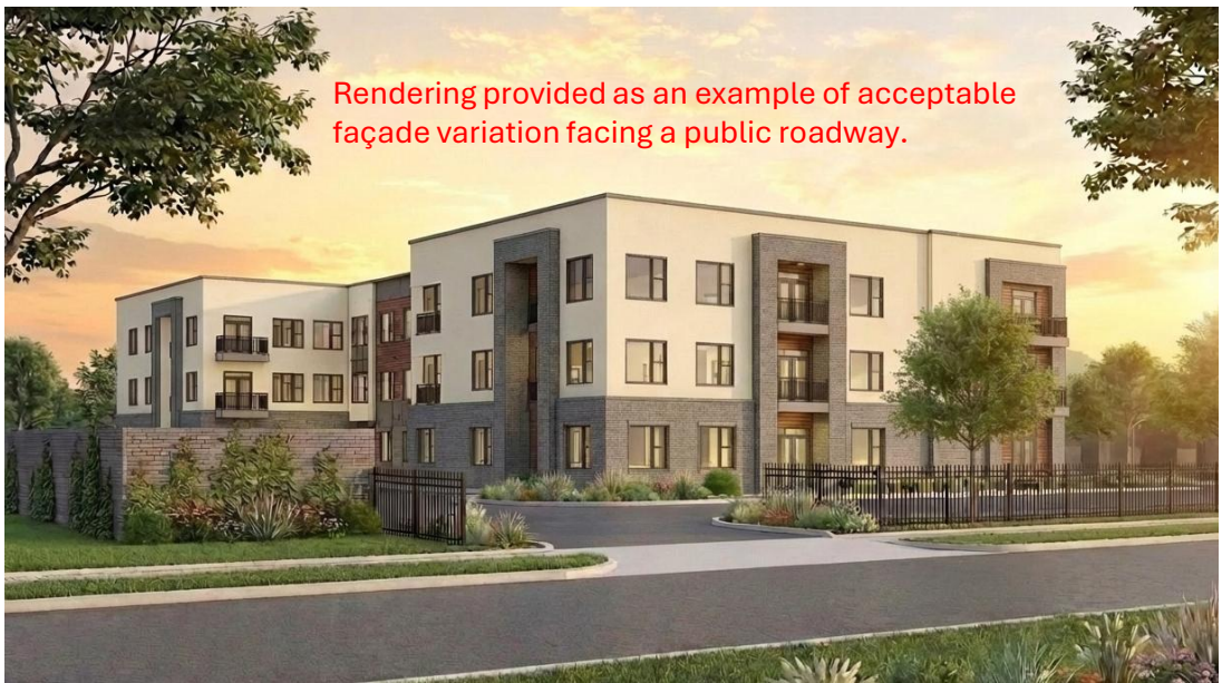
Rendering provided as an example of acceptable façade variation facing a public roadway.