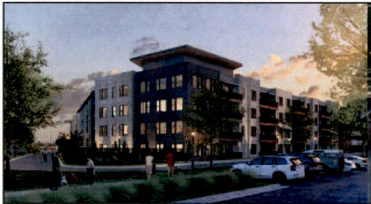
Multi-family Residential Structure with Attached Parking