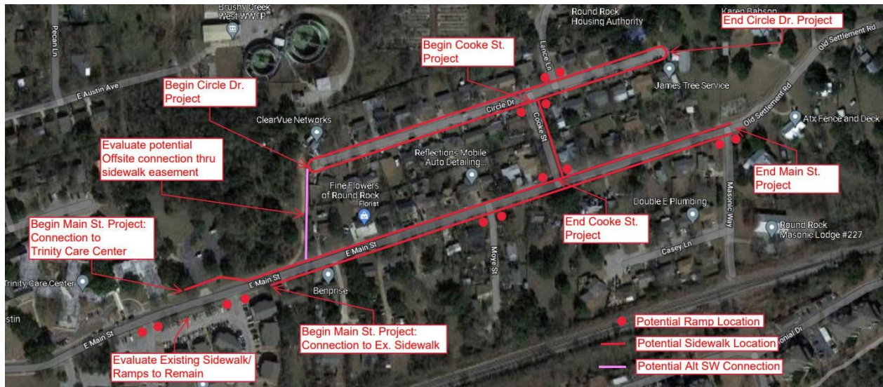
Figure 1: Project Layout