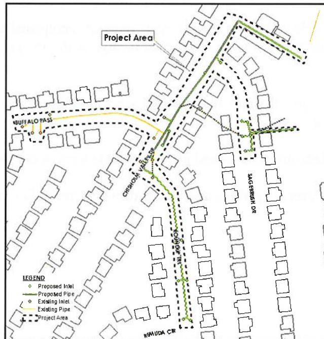
Figure 1. Study Area 3 Project Limits

At the request of the CORR Stormwater Staff, Halff Associates, Inc. (Engineer) has developed this scope and fee proposal to advance the project into design phase services for Study Area 3 in the Chisholm Valley neighborhood (see Figure 1). These services include storm drain design and ground survey, utility investigation and identification of environmental constraints to support the design process. Proposed Study Area 3 flood mitigation solutions included new storm drain on Roundup Trail, Chisholm Valley Drive, and Sagebrush Drive. This proposal assumes that the flood mitigation solution documented in Technical Memo – Chisholm Valley Drainage Assessment Project - Work Authorization No. 2 Flood Reduction Alternative Study , dated 3-19-2019, for Study Area 3.