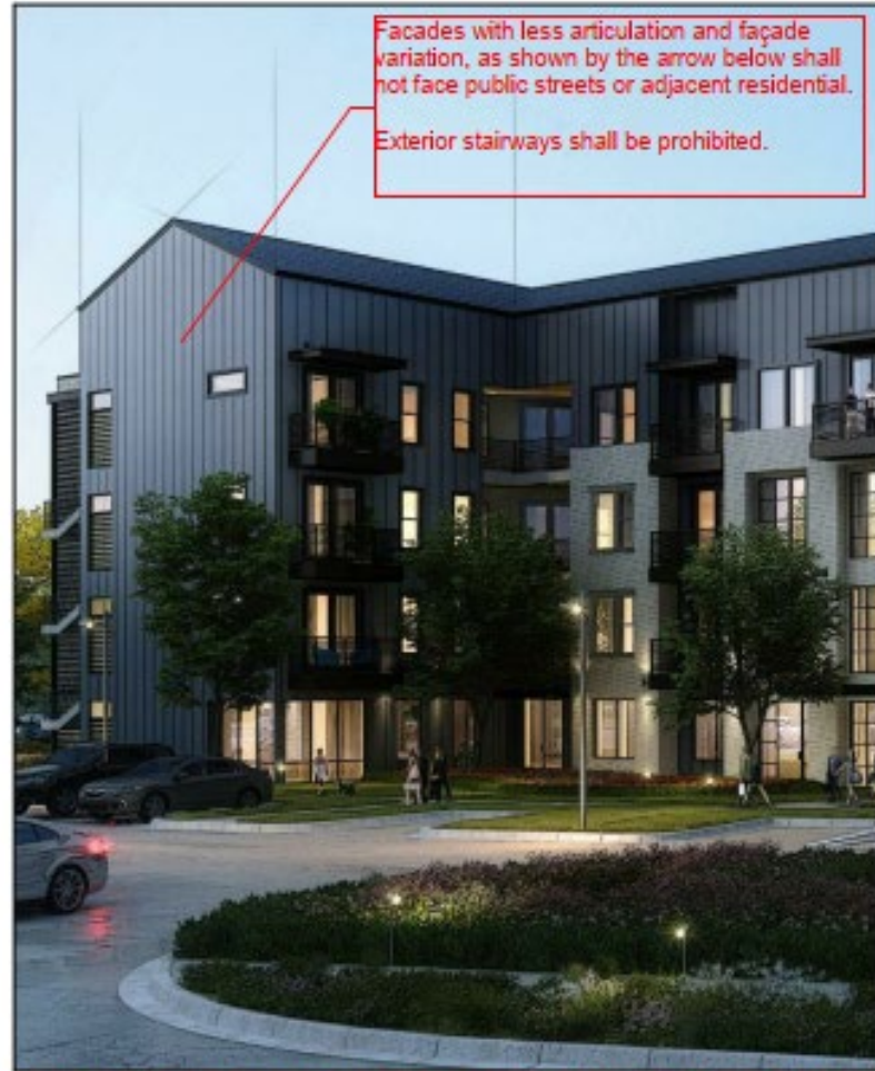
Multi-family Residential Structure with Surface and "Tuck Under" Parking

Facades with less articulation and façade variation, as shown by the arrow below shall not face public streets or adjacent residential. Exterior stairways shall be prohibited.