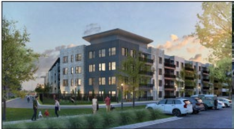
Multi-family Residential Structure with Attached Parking