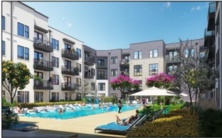
Multi-family Residential Structure with Attached Parking