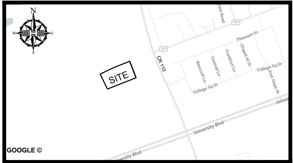
SITE MAP NOT TO SCALE