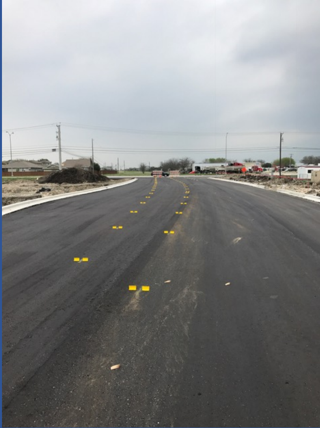
Kenny Fort Boulevard Segment 4B