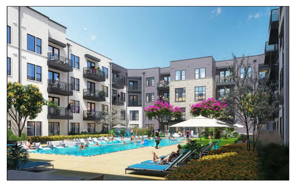
Multi-family Residential Structure with Attached Parking