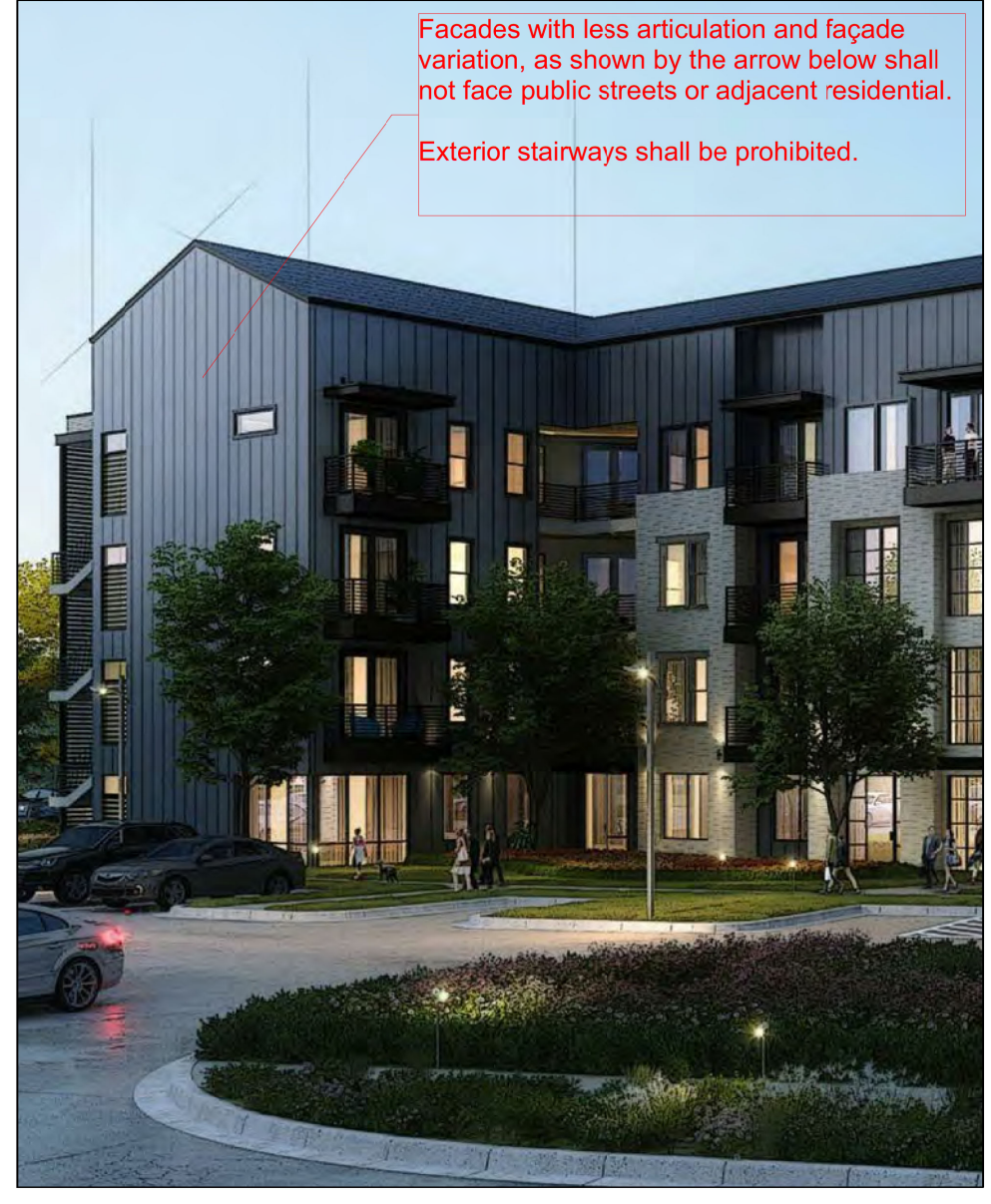
Multi-family Residential Structure with Surface and "Tuck Under" Parking