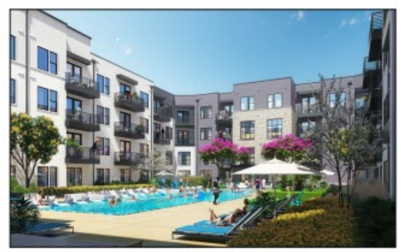
Multi-family Residential Structure with Attached Parking