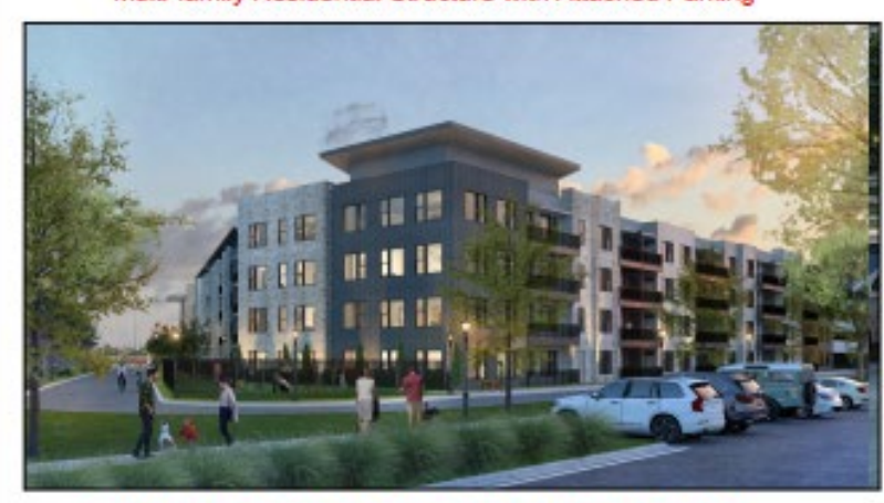
Multi-family Residential Structure with Attached Parking