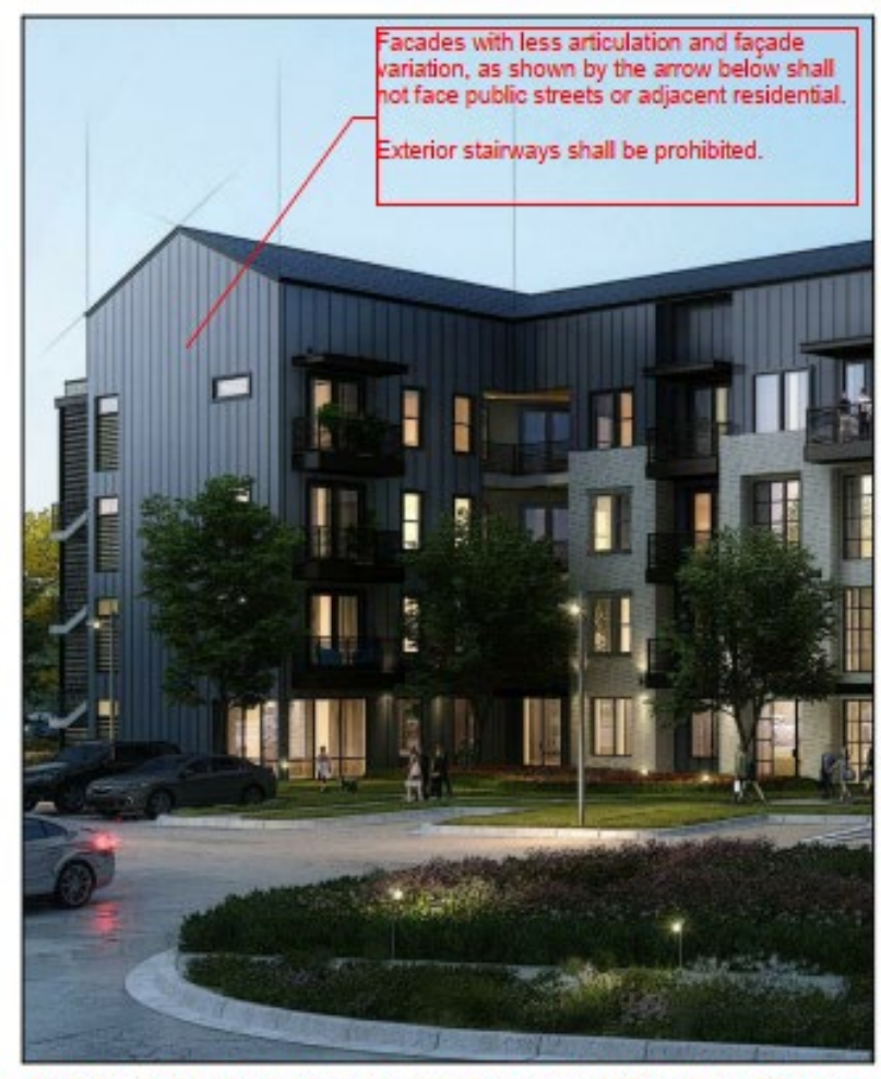
Multi-family Residential Structure with Surface and "Tuck Under" Parking