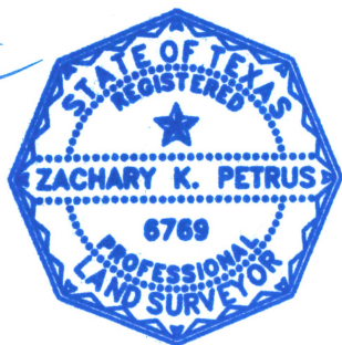
EXHIBIT "A" LEGAL DESCRIPTION OF TRACT A - 149.343 ACRES BEING A PORTION OF THE JACOB M. HARRELL SURVEY, ABSTRACT 284 CITY OF ROUND ROCK, WILLIAMSON COUNTY, TEXAS