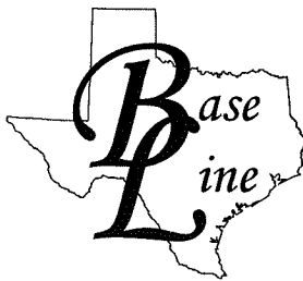
EXHIBIT "A" Land Surveyors, Inc.

8000 Anderson Square Rd., Suite 101 Austin, Texas 78757 Office: 512.374.9722 Firm Reg. No. 10015100