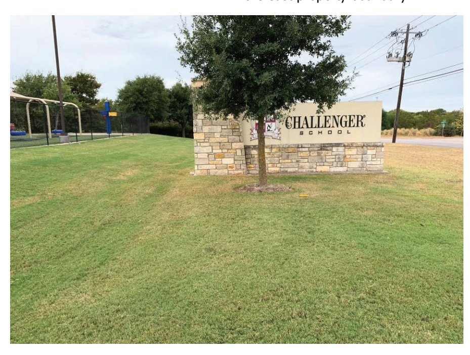
Description: West view along the proposed acquisition from the east property boundary