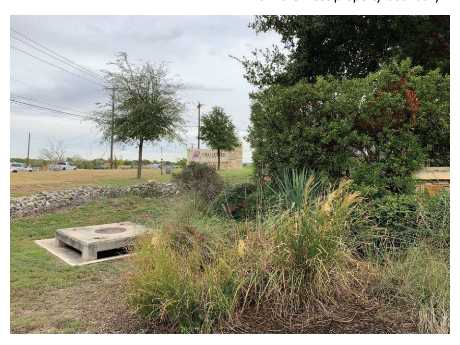
Date Taken: October 17, 2019

Description: East view along the proposed acquisition from the west property boundary