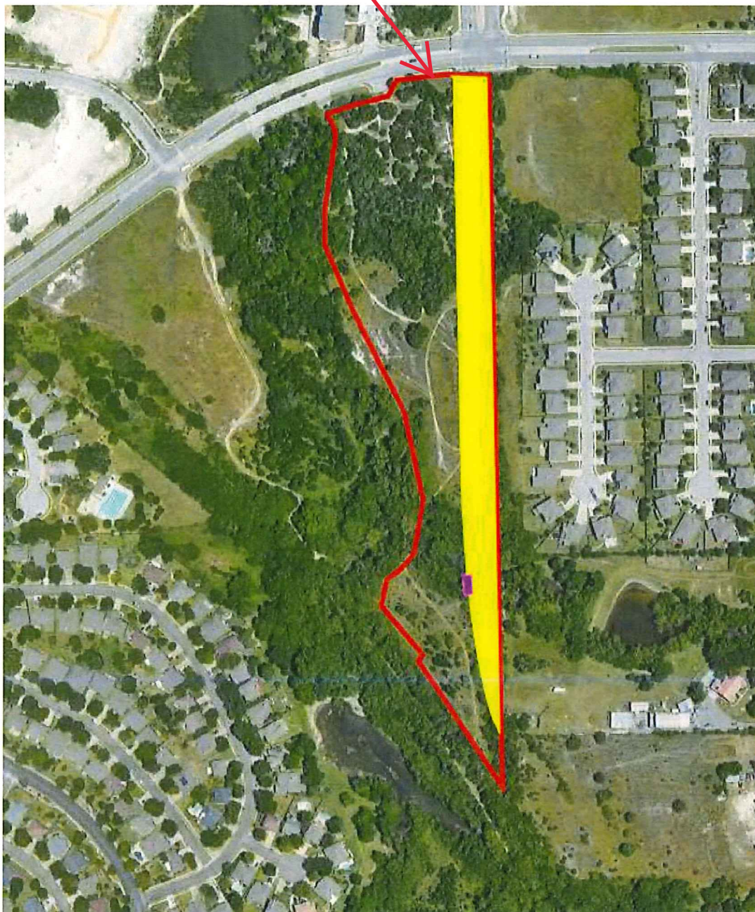
AERIAL IMAGE WITH FEE AND EASEMENT ACQUISITIONS

Forest Creek RTL r.o.w. added to final field notes