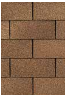
Desert Tan †/††