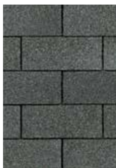
Estate Gray †/††