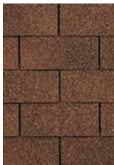
Autumn Brown †