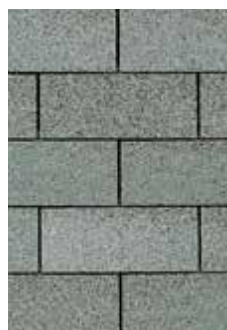
Aspen Gray †