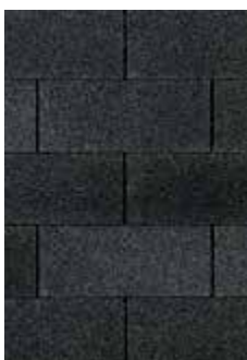
Onyx Black †