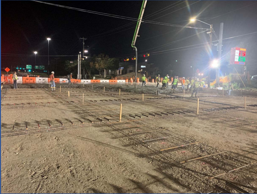
University Boulevard Widening Project